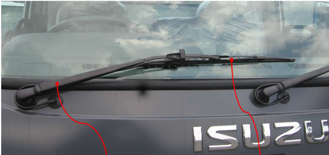
FIG.NO : 8-80 WINSHIELD WIPER & WASHER

No : 001 / PI / PART / IAMI / I / 2014 Tanggal : 24 Jan 2014 Perihal : WIPER BLADE N Series