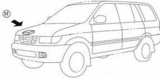
FIG NO : 0-60 SWITCH AND RELAY; INSTRUMENT PANEL

No : FORM/D/16/006/Rev00 Ref No : 012/PI/PART/IAMI/VIII/19 Tanggal : 19 Agustus 2019 Perihal : Relay; Charge